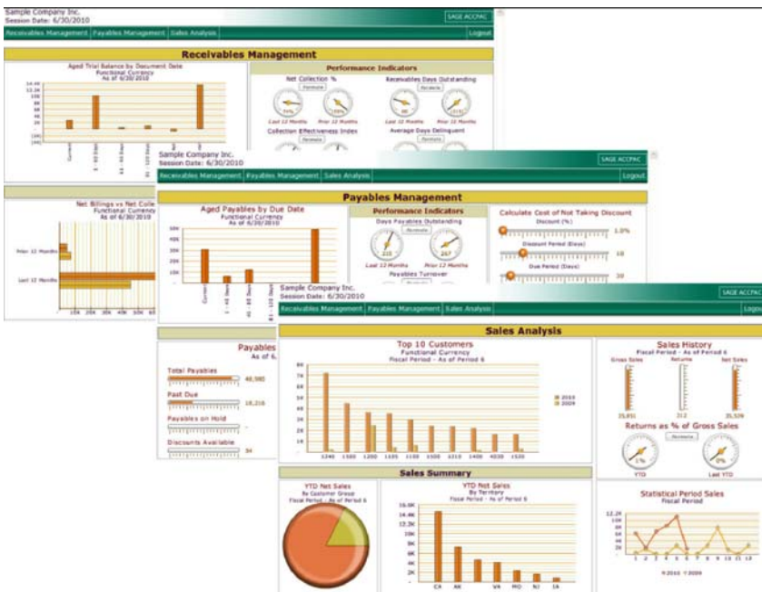
Accounts Payable, receiveable and Sales Analysis dashboards