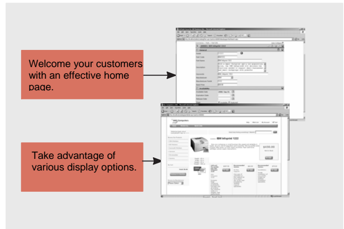
Figure 3: SAP® Business One Web Store

The media browser allows you to upload and download product images and media directly through the Web interface. You can also use this feature to bundle multiple images into Zip files and upload them directly into your media directory.